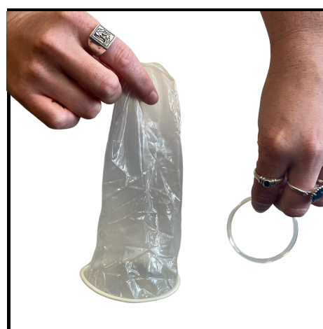
For anal use, remove the ring from inside the condom.