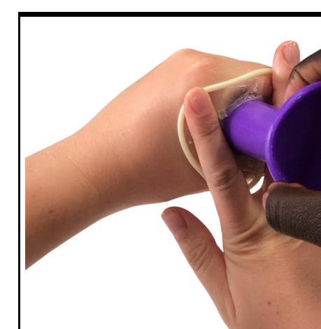
While holding the condom in place, remove the penis, hand or sex toy from the condom.