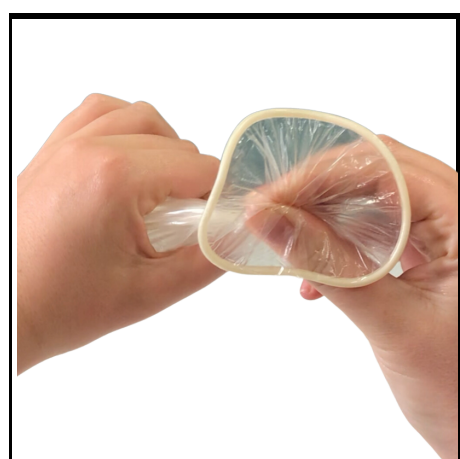
Pinch the opening of the condom to keep it closed, then gently pull the condom out.