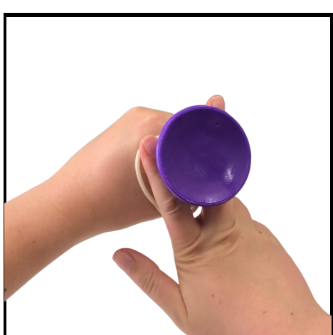
Once you're done, hold the outer ring in place with your hand.