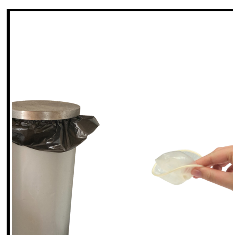
Throw the condom in the bin.