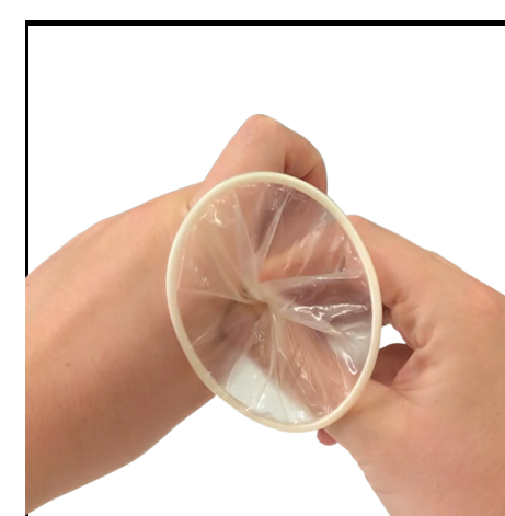
Twist the opening of the condom closed to avoid spilling any ejaculate.