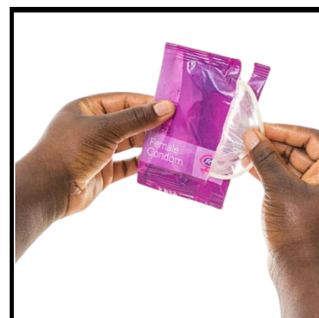
Carefully open the packet with your hands.