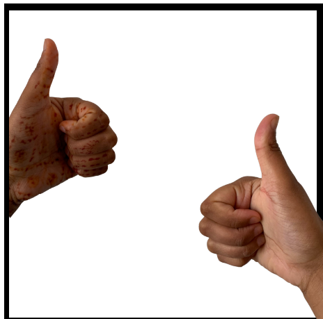
You and your partner both agree to have sex and use an internal condom.