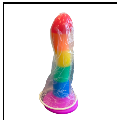
Place the condom over the penis, hand or sex toy.