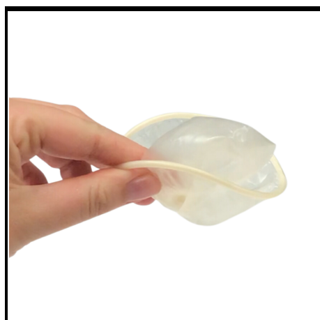
Fold the condom in on itself so it remains twisted and does not spill.