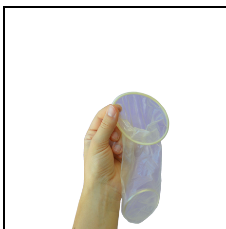
Check the condom has no tears.