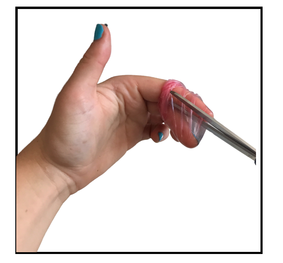
Cut off the bottom of the condom.